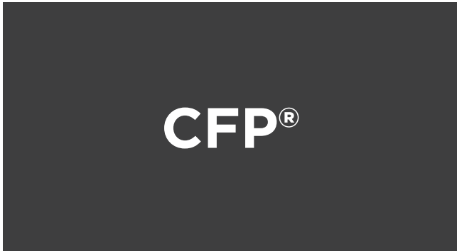
CFP® certification word mark