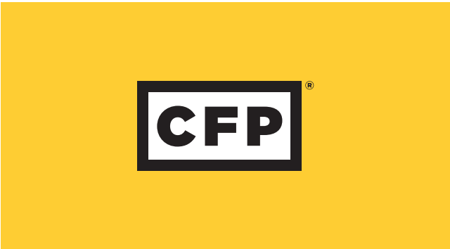
CFP® mark (with plaque design) certification logo